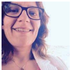
BY CATHARINA NIEUWENHUIZEN