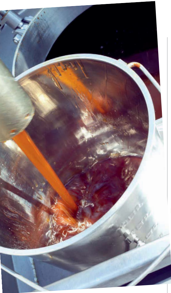
Left: Production of high energy fats

application much easier. This Nobacithin Aqua R100 is based upon rape lecithin. It is a NON-GMO blend. Beside this rape base blend, there are also mixtures of Nobacithin Aqua based upon soybean lecithin.